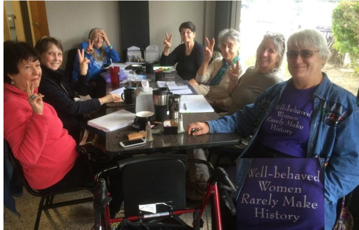
Celia's Garden Café, Fresno, 1/29/16